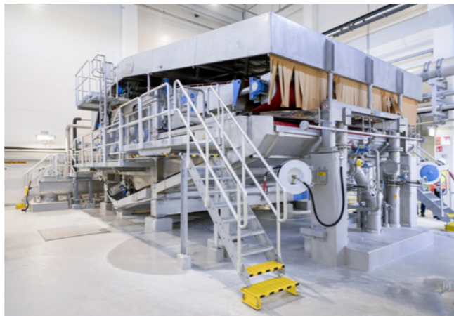
The ANDRITZ Twin Wire Press has been proven in many applications for all pulp types and is the best suited thickening equipment prior to a Flash Dryer.