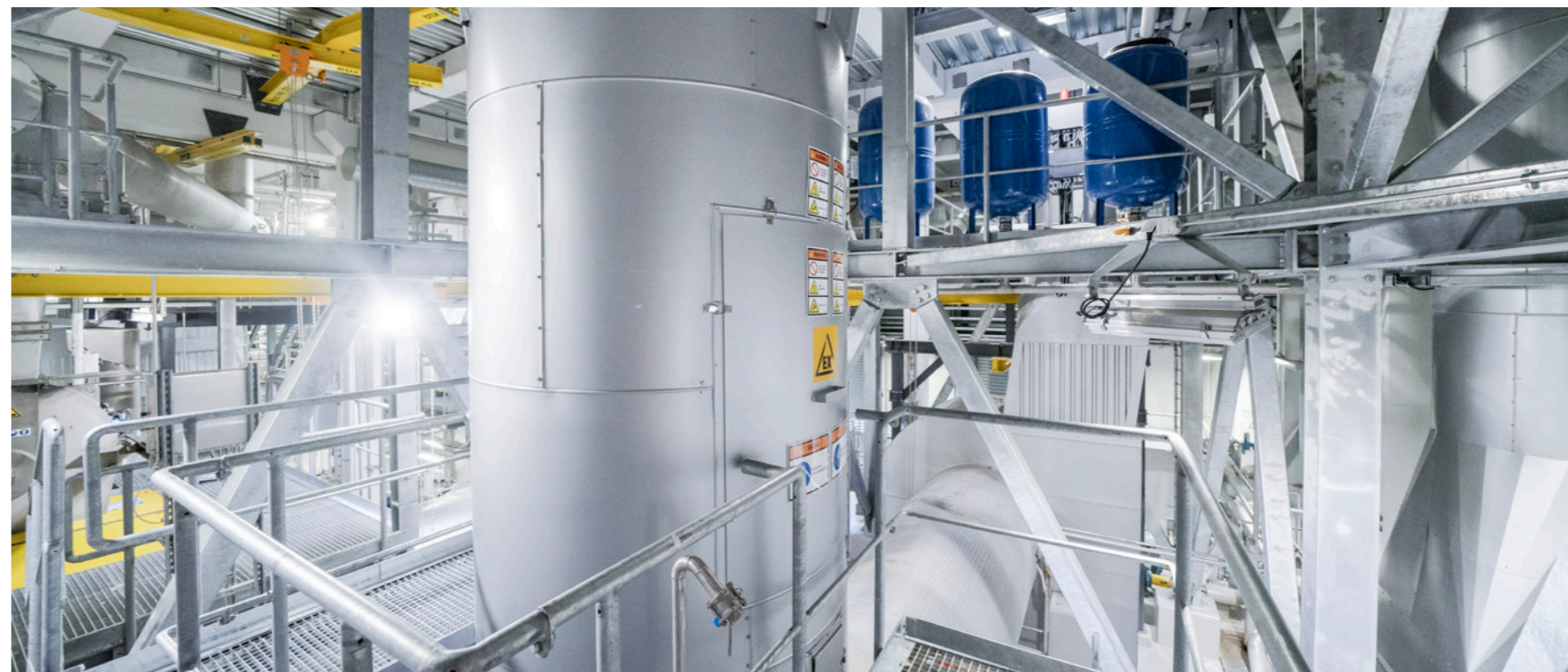
Equipment is easily accessible for service and maintenance, despite the tight space available.

operators, and consultants to make sure that all future needs were also taken into account. "We had a lot of meetings, and we asked our operators to come up with all the ideas and needs they might have for the new line," adds Mäkelä. "We asked them to compile a list of requirements in a spreadsheet detailing where any losses or disruption may take place on the new line. In the end, there was a list of over 200 requirements that we then sent on to the suppliers to the project.