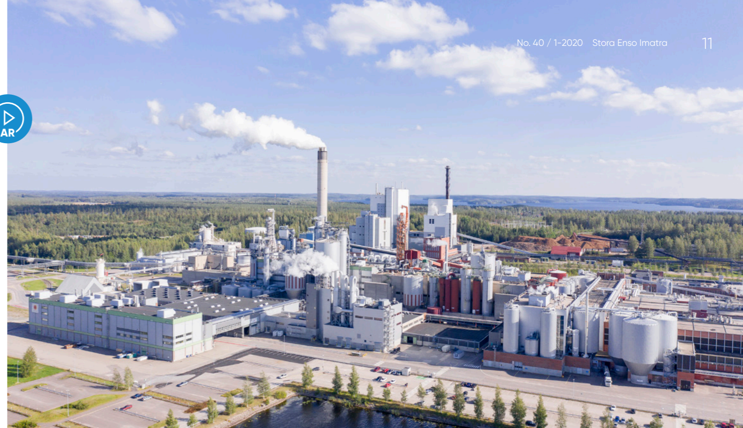
Stora Enso Imatra and ANDRITZ together developed how to locate the Flash Drying plant in an efficient space in the mill. The new Flash Drying Line was fitted into the overall layout.

perfect combination when it comes to consistent and high-quality pulp drying. The Twin Wire Press has been proven in many applications for all types of pulp and is particularly pulps that are difficult to dewater and to reach high discharge dryness – a prerequisite for obtaining lower thermal energy consumption in the flash dryer.